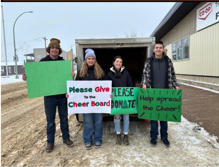
Grade 11 students volunteering at the Food Drive on Dec. 6th.