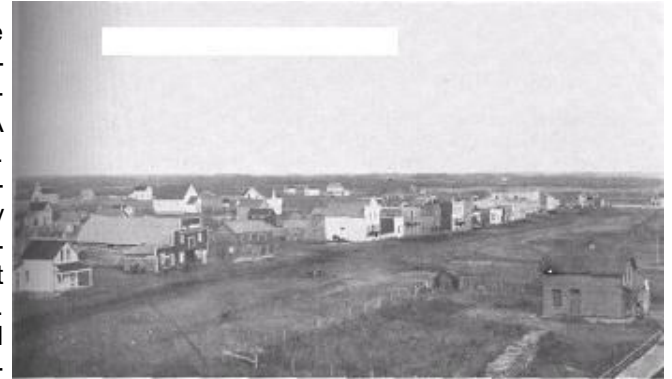
The town of Crandall in early years