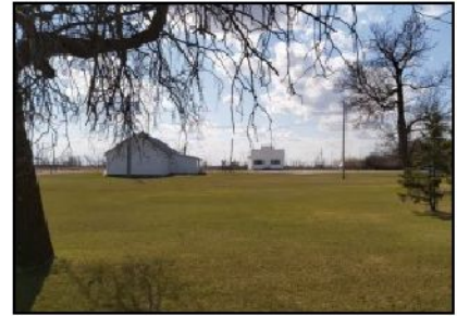
Foxwarren DESC 4/7 - 2-U 60 x 257 PVM Incentive Price: Only $154.20