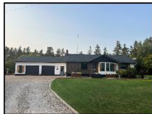
RD 144 Solsgirth Road, Shaol Lake, MB 1 storey, 1418 sq. feet 4 bedroom, 2.5 bathroom Land size = 9.99 acres Price = $349,000 Visit realtor.ca for details.