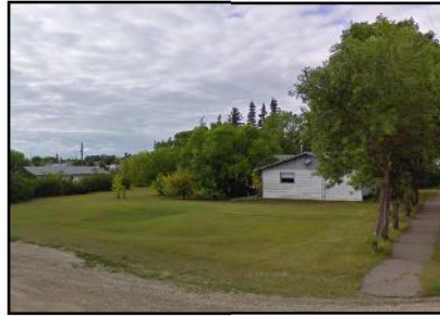
Miniota DESC 6-7386 & DESC 4-7386 100 x 68 & 50 x 178 - Serviced PVM Incentive Price: Only $157.00