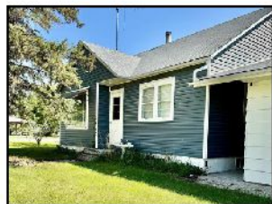
188 Sarah Avenue, Miniota, MB 1 storey, 804 sq. feet 2 bedroom, 2 bathroom Land size = 50x120 lot Price = $134,900 Visit realtor.ca for details.