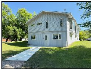
81 12th Street, Birtle, MB Lower level duplex 2 bedroom 1320 sq. feet 1 year lease and rental application required Contact: 204-773-0096