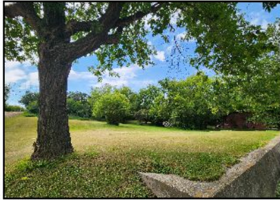
Birtle 862 Vine Street 102 x 132 - Serviced PVM Incentive Price: Only $134.64

PVM Lots For Sale - For more info email cdc@myprairieview.ca