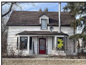
141 Louisa Avenue E, Miniota, MB 1.5 storeys, 1338 sq. feet 4 bedroom, 1 bathroom Land size = unknown Price = $118,000 Visit realtor.ca for details.