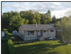
1144 Vine Street, Birtle, Manitoba 1 storey, 1239 sq. feet 3 bedroom, 1 bathroom Land size = unknown Price = $149,000 Visit realtor.ca for details.