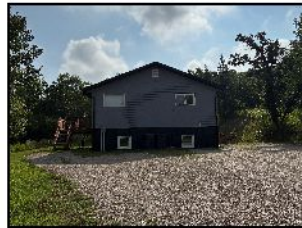
98 7th Street, Birtle, MB Upper level duplex 3 bedroom 1340 sq. feet 1 year lease and rental application required Contact: 204-773-0096