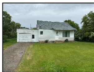
221 College Avenue, Foxwarren, MB 1.5 storeys, 1140 sq. feet 4 bedroom, 1 bathroom Land size = 75x120 lot Price = $39,000 Visit realtor.ca for details.