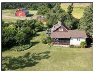
MLS® Number: 202521632 Foxwarren, MB 1.75 storeys, 1680 sq. feet 3 bedroom, 3 bathroom Land size = 80 acres Price = $495,000 Visit realtor.ca for details.